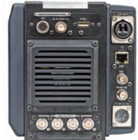
Rear panel of UHL-43 with optional 12G-OPT and Quadlink

Design and specifications are subject to change without notice.