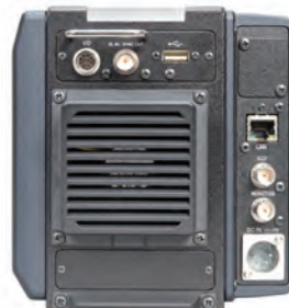
Rear panel of UHL-43(standard)