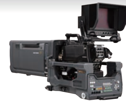
Black color (SA-1000-S2/SA-100-S4)