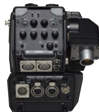
CX-HD1300 50Hz ,Fisher Rear Panel