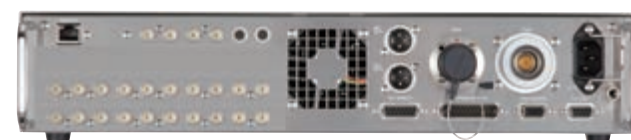
CU-HD1300FT Rear Panel (Fiber/Triax)