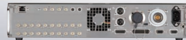
Rear Panel (Fiber and Triax)