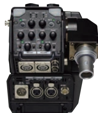
CX-HD1300 60Hz, Kings Rear Panel