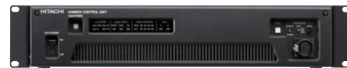
CU-HD1300FT Front Panel