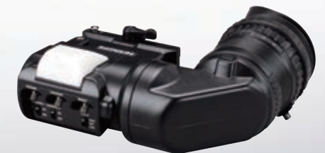
VF-L20HD 2inch Color LCD Viewfinder

CAUTION : To ensure safe operation, please read the instruction manual before using this product.